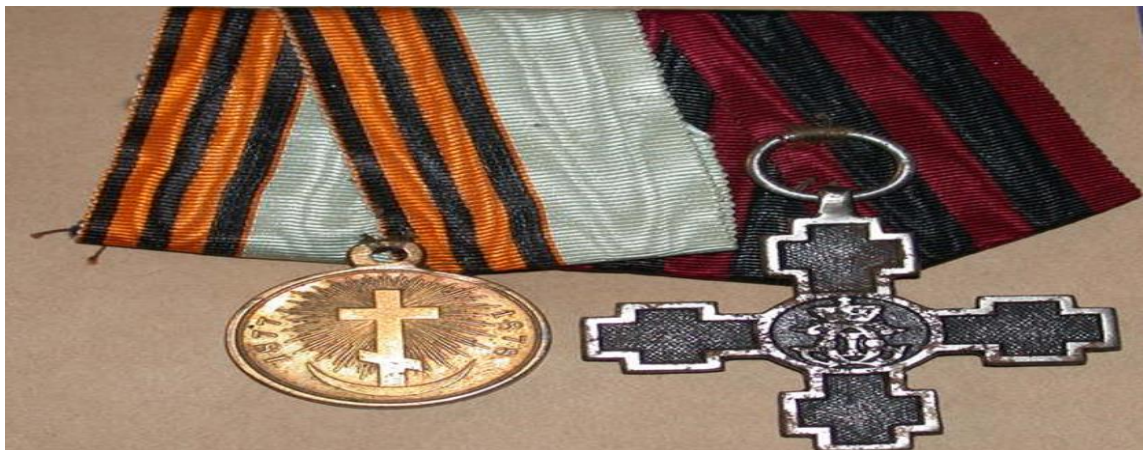
Figure 5: On the left, given by the Russian Emperor to the Finnish soldiers, on the right, given by the Romanian King to the soldiers who crossed the Danube.

Also, there were many different objects about Finnish soldiers and their remembrance, for example this medal was at the Finnish War Museum in Helsinki, Suomenlinna.