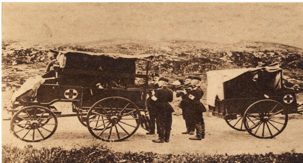
Figure 3: The Finnish Red Cross ambulances from the period of the autonomy, for the transport of the sick and wounded in the Russo-Turkish War of 1877-78. 50

coastal area, by strengthening the fortress defenses of Sveaborg (Suomenlinna) and Vyborg, strengthening positions near the Helsinki, set up an optical telegraph along the coast for communication, and harvest bottom mines for defending. 49