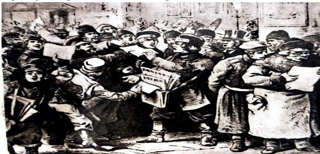
Figure 2: Announcement of the declaration of war in St. Petersburg. 35

erupted in 1875–1876, various publications 33 appeared in Europe, translated into several languages, all pointing to Russian expansionism on Pan-Slavic grounds (especially on Bulgaria, Serbia, and Montenegro). 34