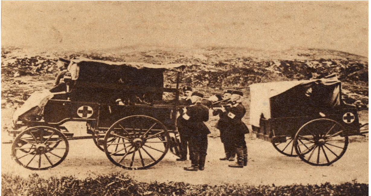
Figure 3: The Finnish Red Cross ambulances from the period of the autonomy, for the transport of the sick and wounded in the Russo-Turkish War of 1877-78. 50

coastal area, by strengthening the fortress defenses of Sveaborg (Suomenlinna) and Vyborg, strengthening positions near the Helsinki, set up an optical telegraph along the coast for communication, and harvest bottom mines for defending. 49