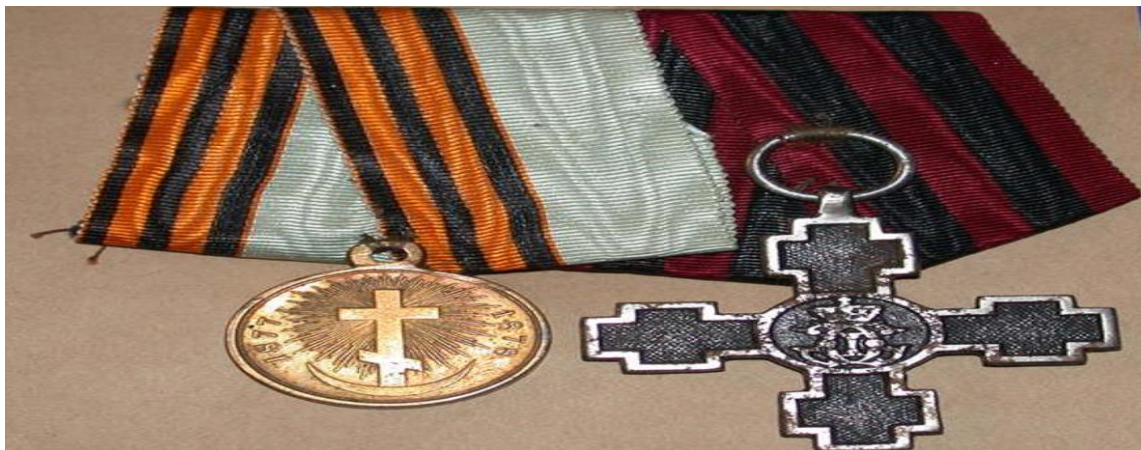
Figure 5: On the left, given by the Russian Emperor to the Finnish soldiers, on the right, given by the Romanian King to the soldiers who crossed the Danube.

Also, there were many different objects about Finnish soldiers and their remembrance, for example this medal was at the Finnish War Museum in Helsinki, Suomenlinna.