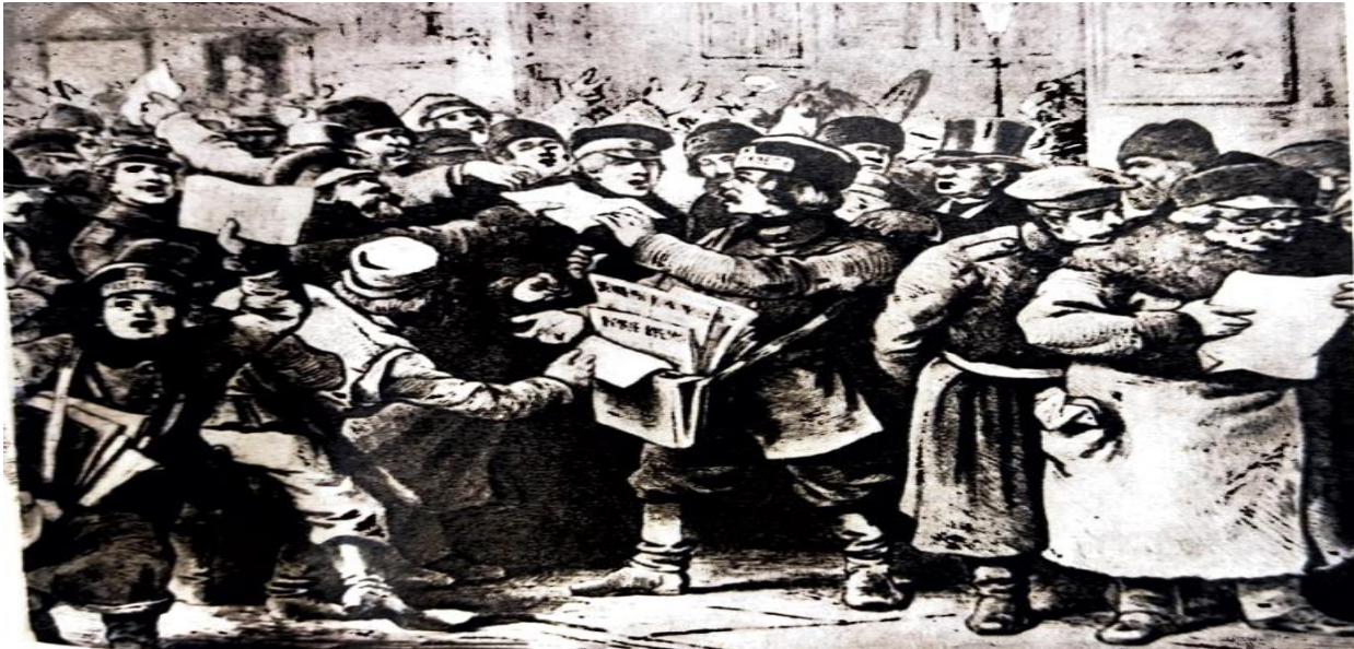
Figure 2: Announcement of the declaration of war in St. Petersburg. 35

erupted in 1875–1876, various publications 33 appeared in Europe, translated into several languages, all pointing to Russian expansionism on Pan-Slavic grounds (especially on Bulgaria, Serbia, and Montenegro). 34