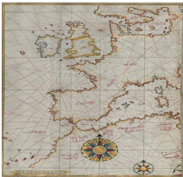
Figure 2: The Map of Europe from Piri Reis, “Kitab-ı Bahriye” second version, 1525-1526. Manuscript copied in 17th century, İstanbul University Library, İstanbul (T. 6605).

The book called Kitab-ı Bahriye 4 (Book of Navigation on Mediterranean Coasts) gives a lot of key information about the Mediterranean Sea, cities and towns on the Mediterranean coast and islands with illustrations and text on navigation and seafaring. Piri Reis first wrote Kitab-ı Bahriye in 927 AH/1520-1521 CE and then added other parts of book in 932 AH/1525-1526 CE.