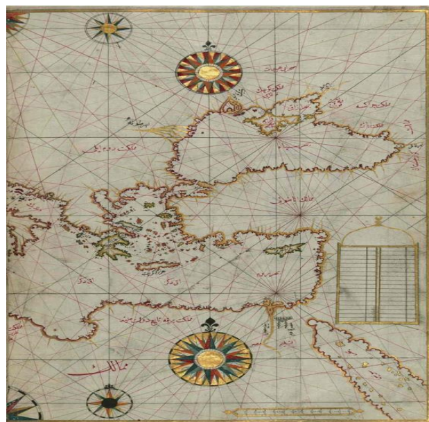
Figure 3: The Map of Europe from Piri Reis, “Kitab-ı Bahriye,” second version, 1525-1526. Manuscript copied in 17th century, İstanbul University Library, İstanbul (T. 6605)

In a specific chapter of Kitab-ı Bahriye, Piri Reis says that he abided by the internationally approved map cartography traditions of his time. Cities and castles are shown by red stripes, desolate places by black stripes, debris and giblets by black points, shallows and sandy places by red points and secret rocks by crosses.